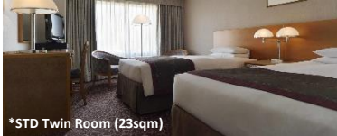
*STD Twin Room (23sqm)