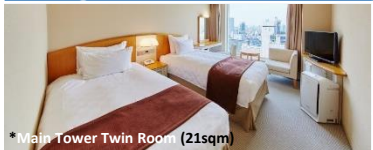
*Main Tower Twin Room (21sqm)