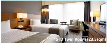
*STD Twin Room (23.5sqm)

Est. 5 mins walk from JR Shinjuku Station