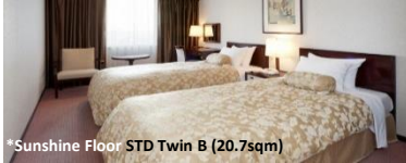
*Sunshine Floor STD Twin B (20.7sqm)